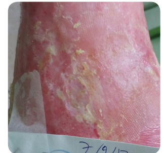
123 days after presentation