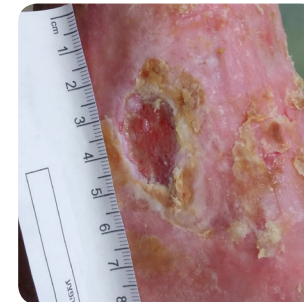
70 days after presentation