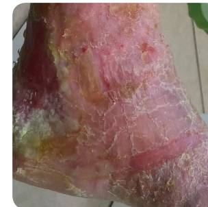
134 days after presentation